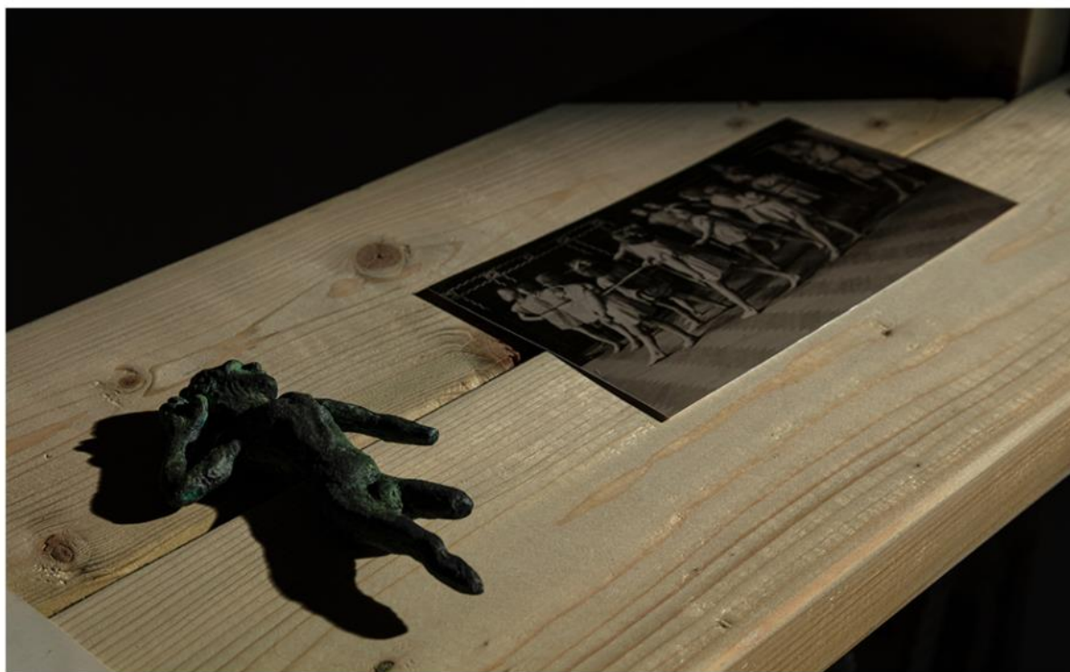
Ben Judd The Origin detail.