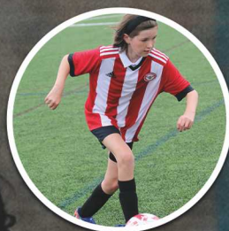
HALF TIME PENALTY SHOOT-OUT

Free entry Register your interest online VISIT BRENTFORDFC.COM FOR MORE INFO