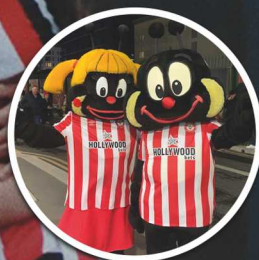
MEET BUZZ BEE & BUZZETTE