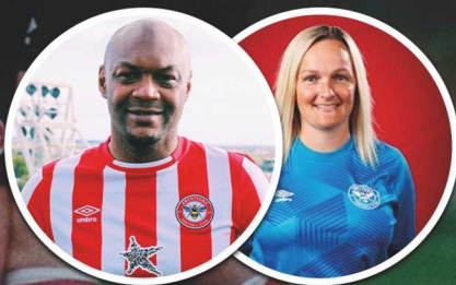
OUR CLUB AMBASSADORS WILL BE IN ATTENDANCE