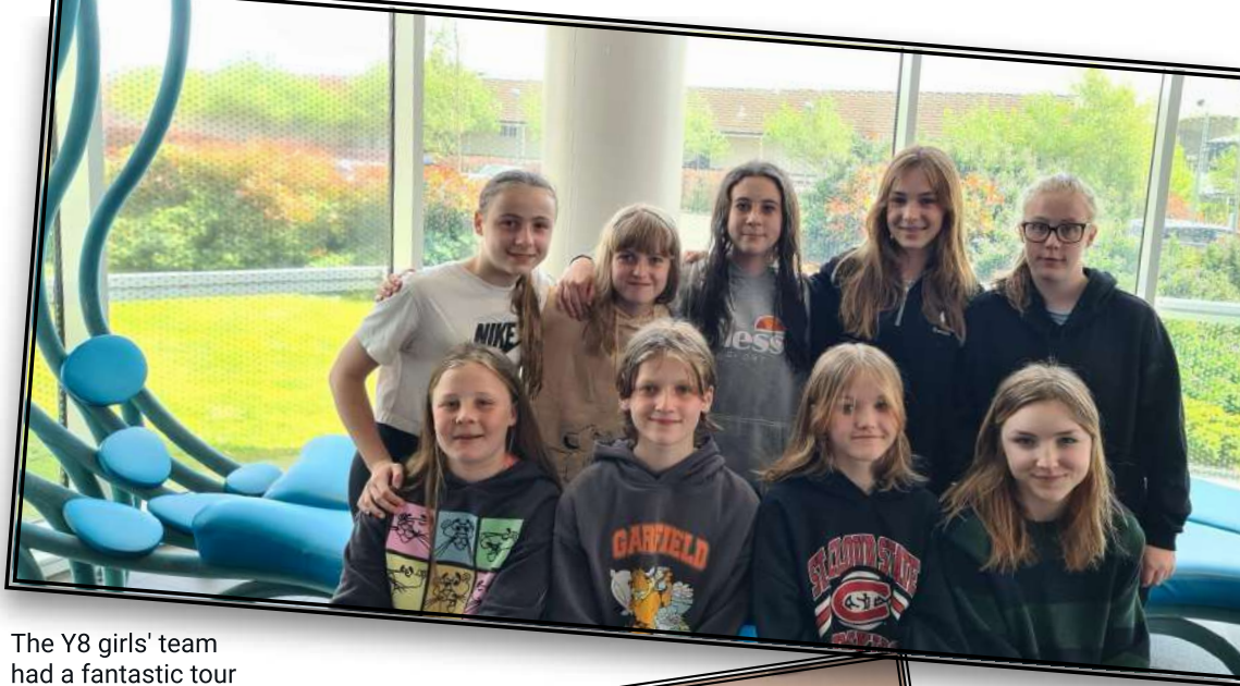
The Y8 girls' team had a fantastic tour on and off the pitch.